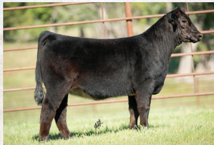
CELL JADE 1157J High-selling heifer in the 2021 Fall Harvest Sale CELL Fascination 8231F Daughter