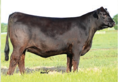
MAGS AMERICAN BEAUTY Dam of Lot 46