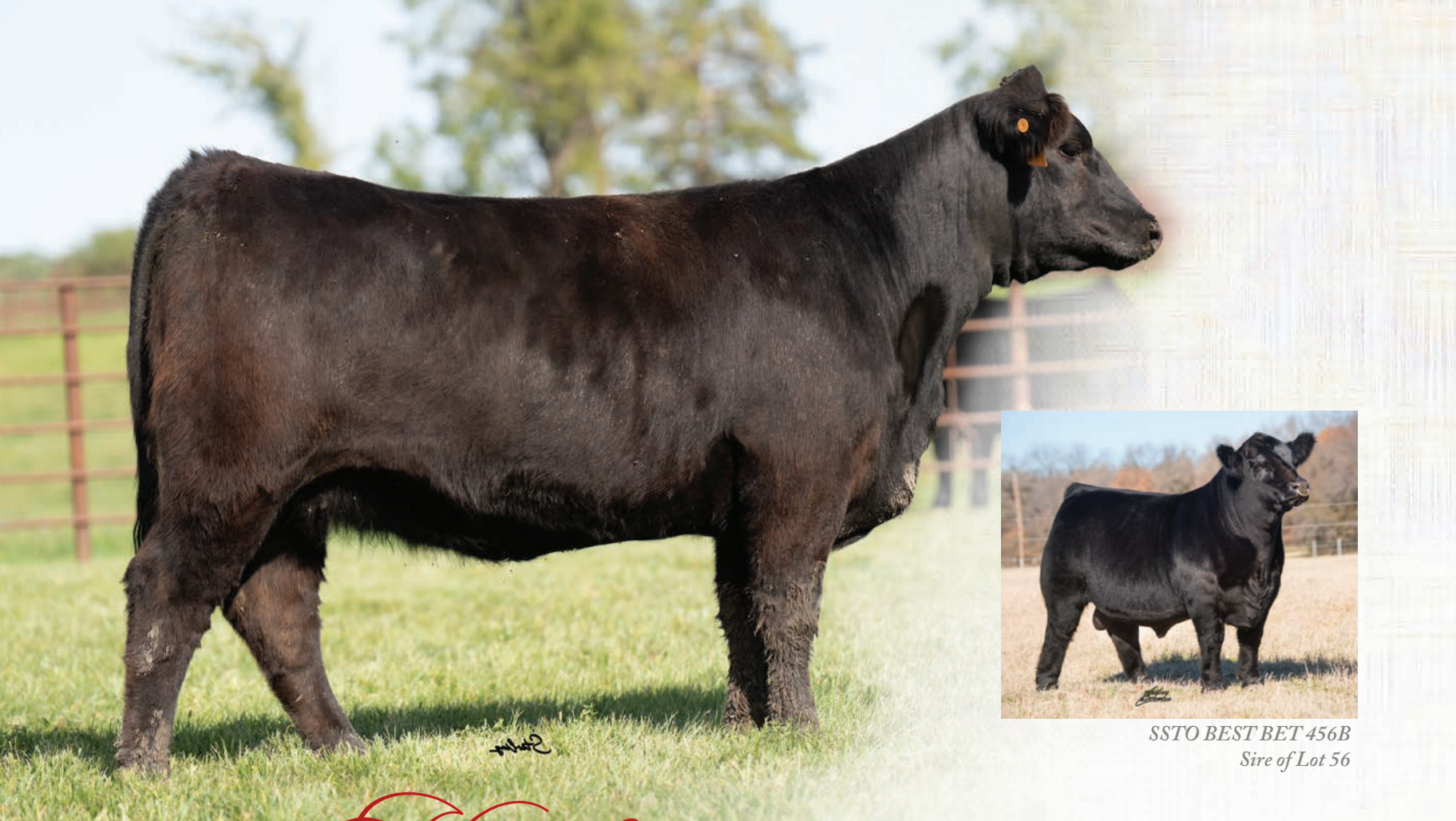
SSTO BEST BET 456B Sire of Lot 56