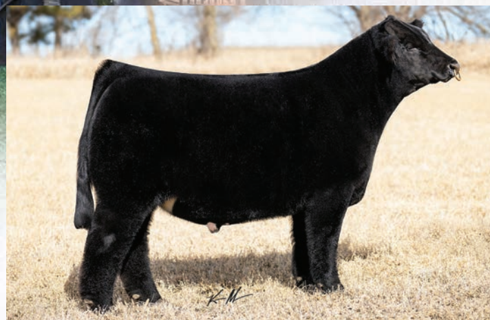
Ratliff Jumpstart, Full sib to Lot 4 Pregnancy Champion Limousin Bull, 2022 Cattlemen's Congress