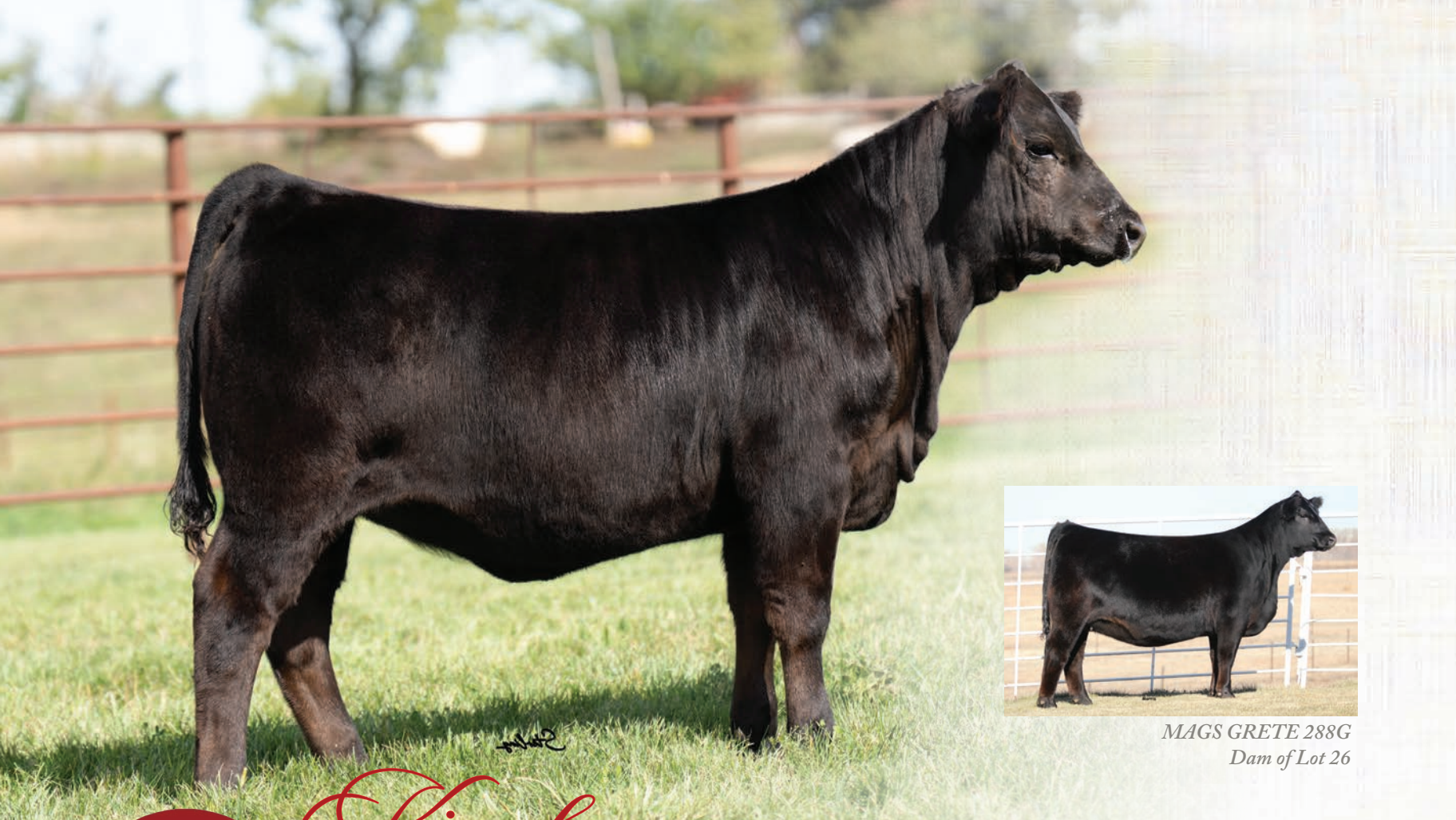
MAGS GRETE 288G Dam of Lot 26