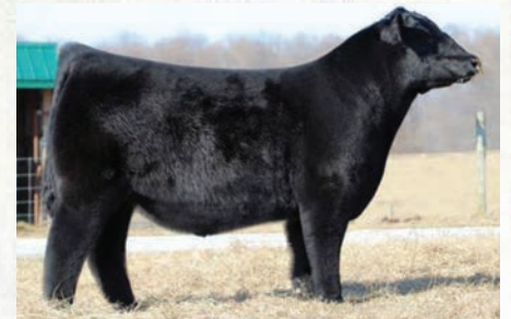
SCC SCH 24 KARAT 838 Sire of Lot 9