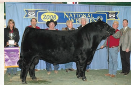
DHVO DEUCE 132R Maternal Grandsire of Lot 10