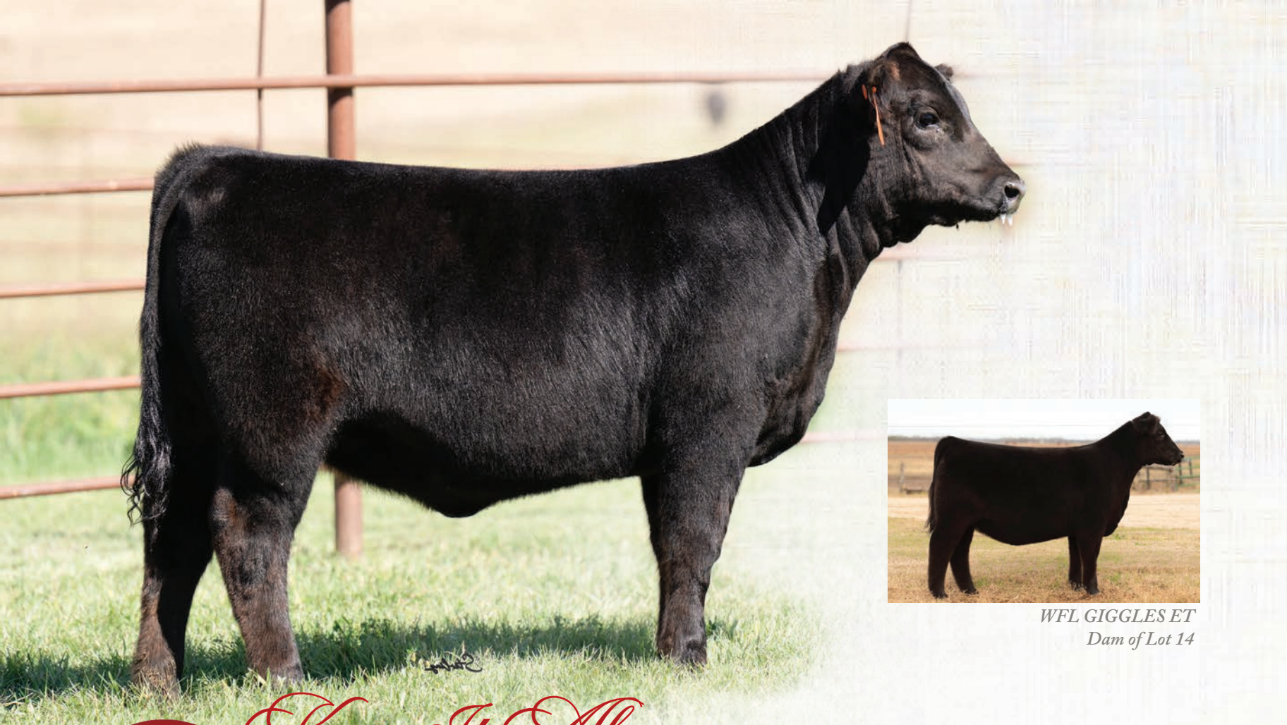
WFL GIGGLES ET Dam of Lot 14