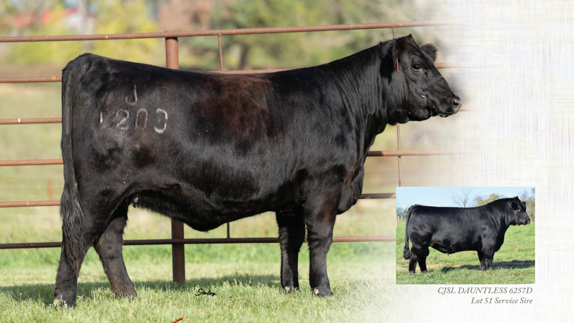
CJSL DAUNTLESS 6257D Lot 51 Service Sire