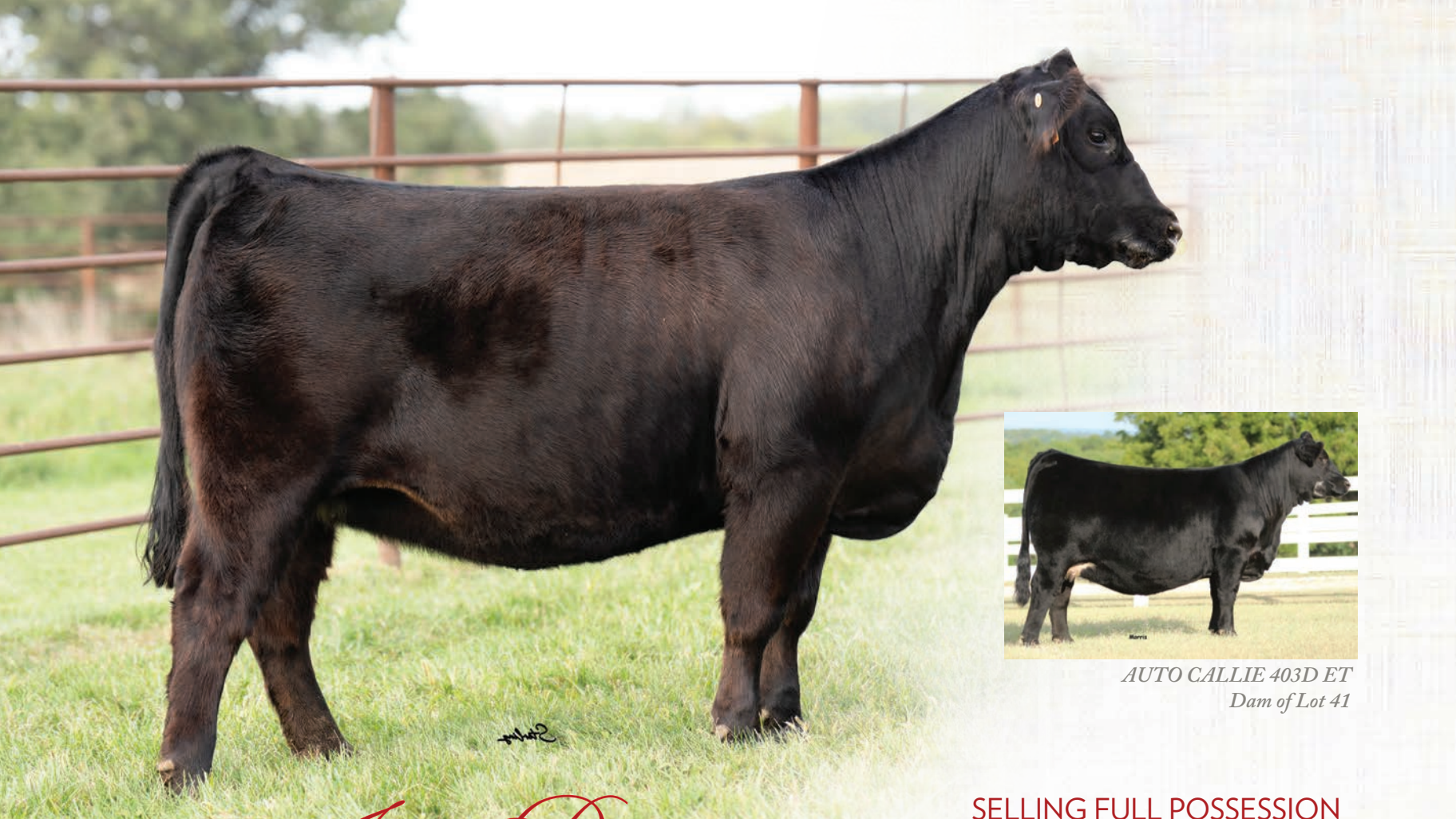
AUTO CALLIE 403D ET Dam of Lot 41