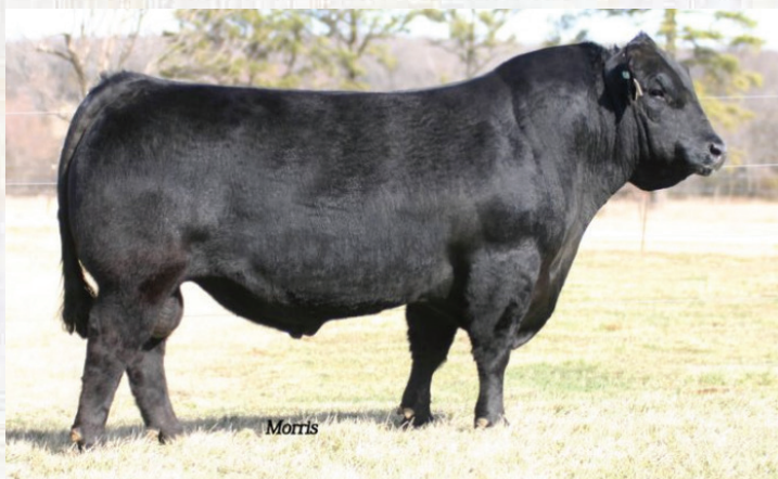
MAGS UR A ROBIN - Paternal Great Grandsire of Lot 39