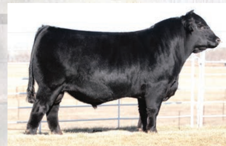
MAGS Firestone 218F Sire of Lot 5