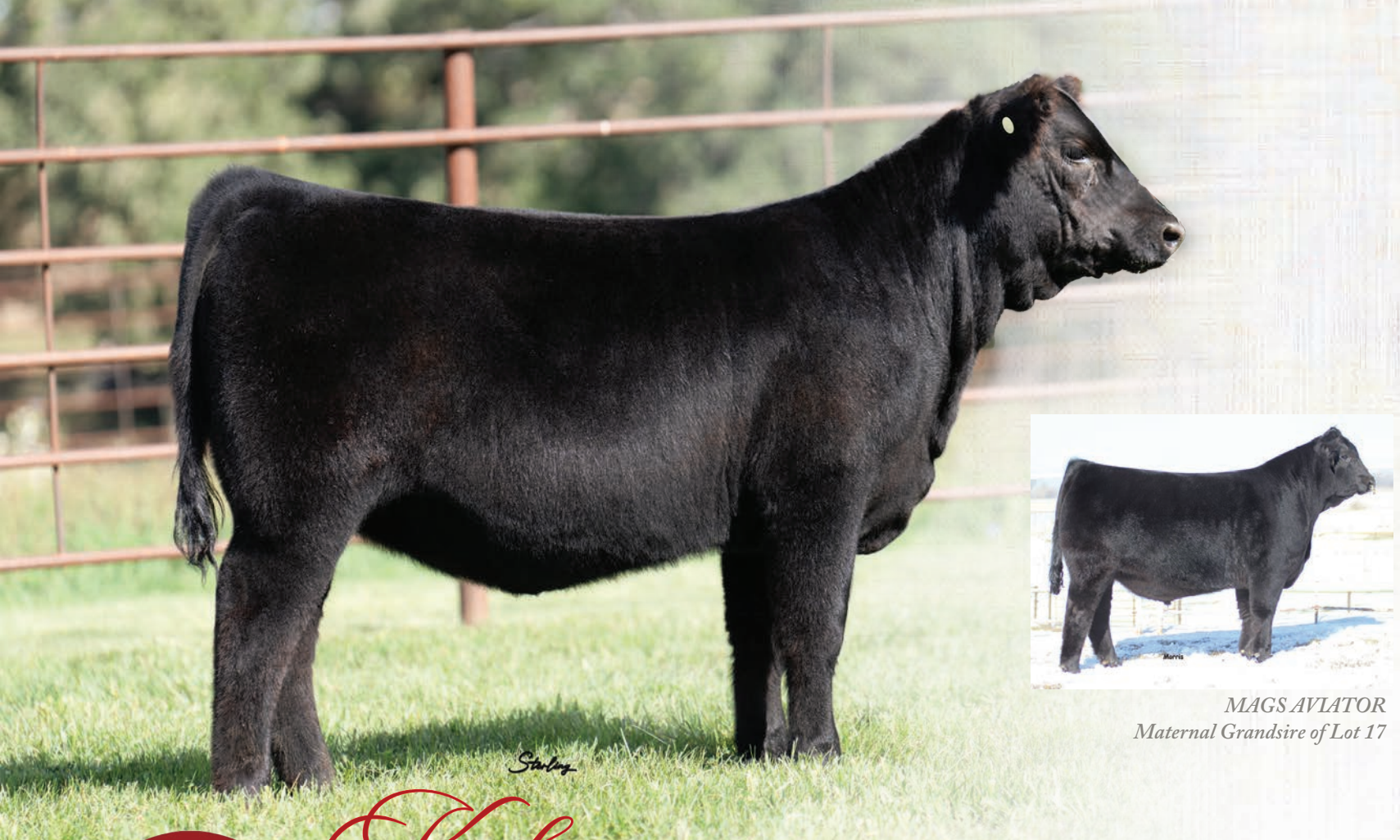
MAGS AVIATOR Maternal Grandsire of Lot 17