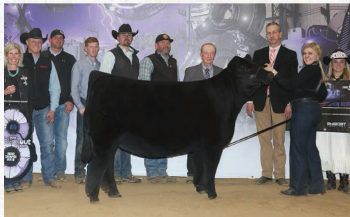
ALYN Duchess 600D a Envision daughter, paternal sibling to lot 40 and 2022 Blackout Jackpot Show Supreme Champion.