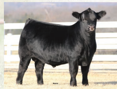
HUBB Grand Central Sire of Lot 23