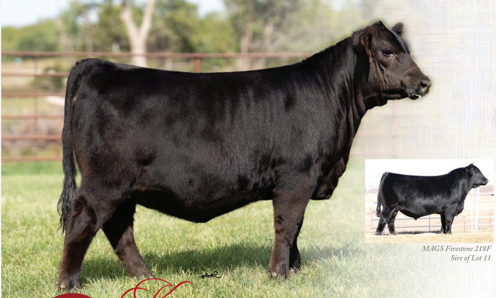
MAGS Firestone 218F Sire of Lot 11