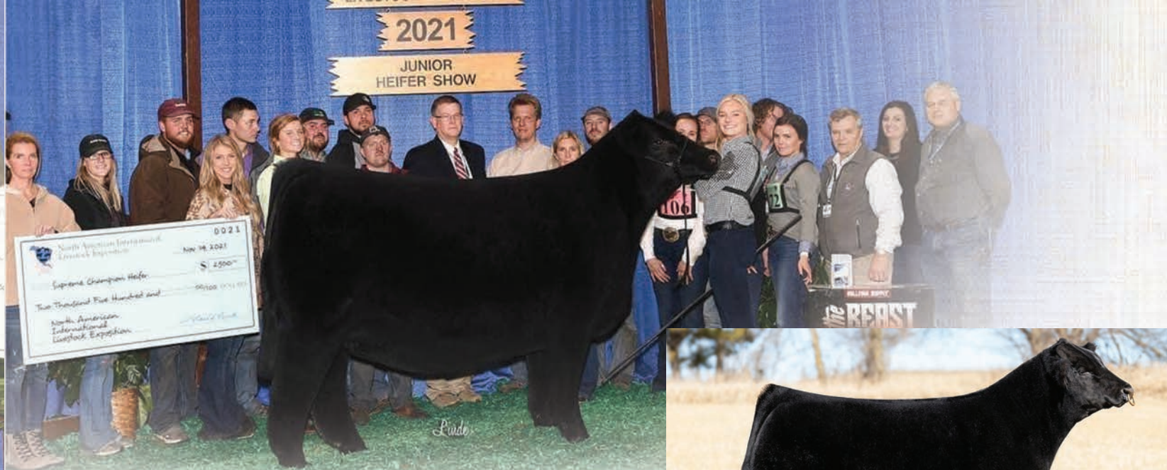
Ratliff Howaboutit Riverstone Charmed Daughter Supreme Junior Female, 2021 NALIE