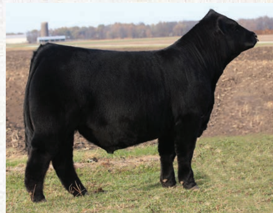
SSTO GUNS N ROSES 9408G Sire of Lot 38