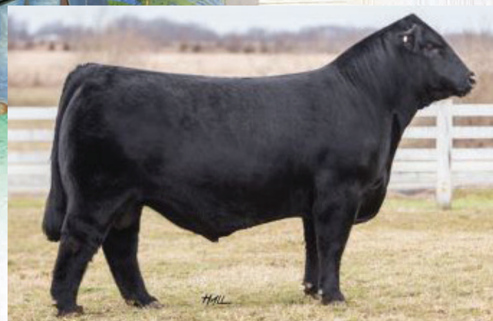
FWLY Can Do – Sire of Lot 4 & 7