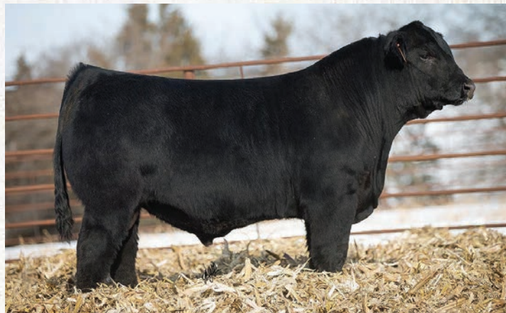
CELL History Maker - Son of CELL Envision