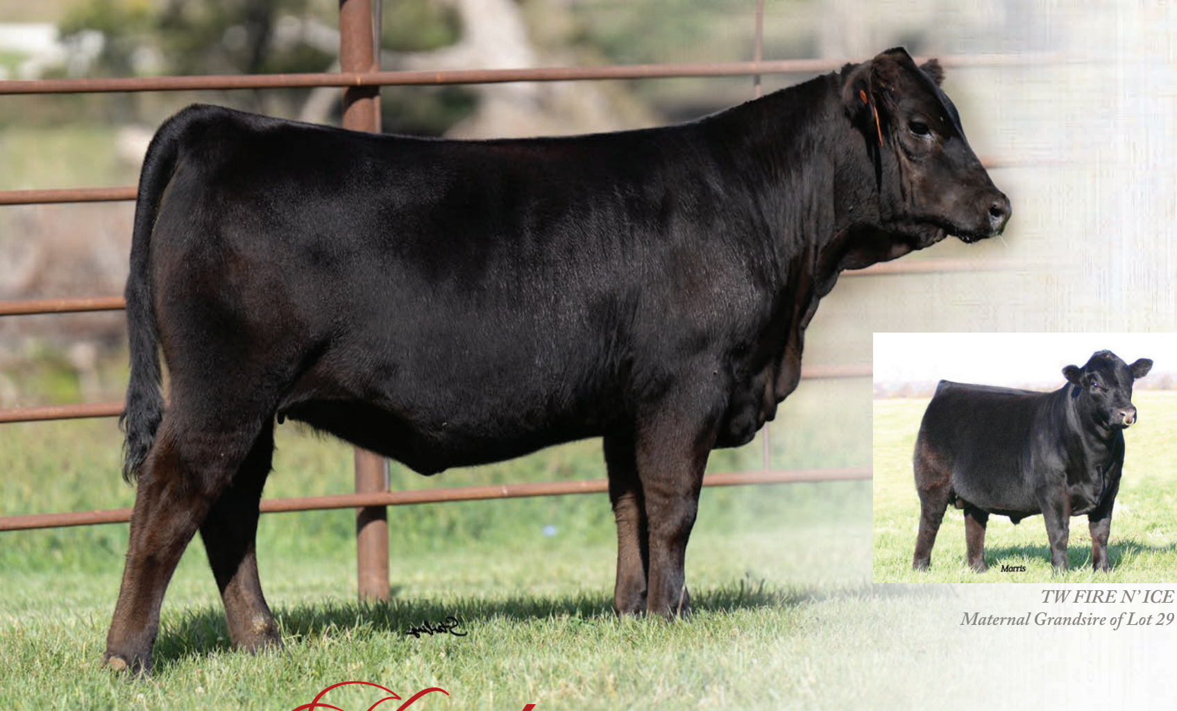
TW FIRE N' ICE Maternal Grandsire of Lot 29