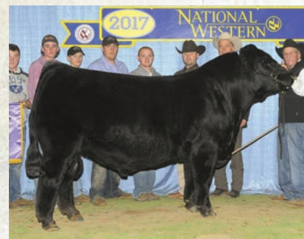
TASF CROWN ROYAL 960C Sire of Lot 32