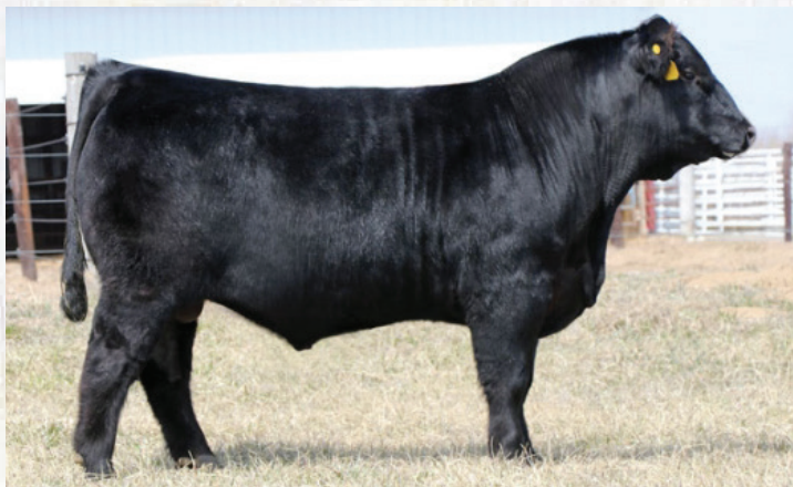
CELL Envision - Full sib to Lots 29, 30 & 31